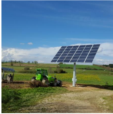
Agricultural exploitation using solar tracker